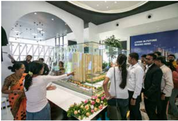
Customers at the site on Launch day

Under the path-breaking and evolutionary concept of