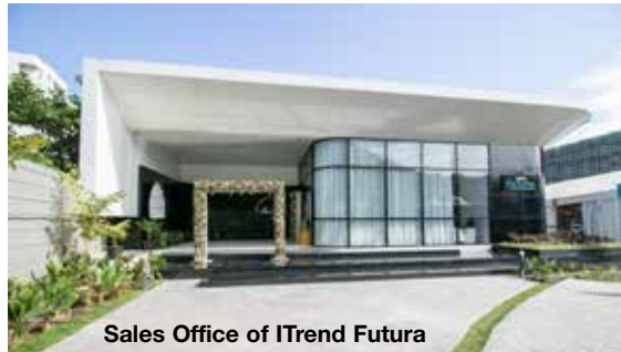
Sales Office of ITrend Futura

ITrend Homes, both of these stalwarts have come together for envisioning the future-ready, smartest homes in Baner NX, named ITrend Futura. These two have made wonders in the past and now they are all set to transform the perception of living with the most advanced technology-led innovations.