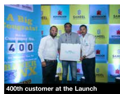
400th customer at the Launch

'Convertible Homes' and zero waste layouts, have been wholeheartedly appreciated by our ever-growing community of delighted customers and the market alike. The idea is to leverage every possible opportunity to make the living a lot more fulfilling and rewarding. All the ITrend communities we have developed are exemplars of a trendy & happening life in tune with the future.